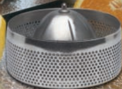
Removable perforated strainer for centrifugal squeezing.