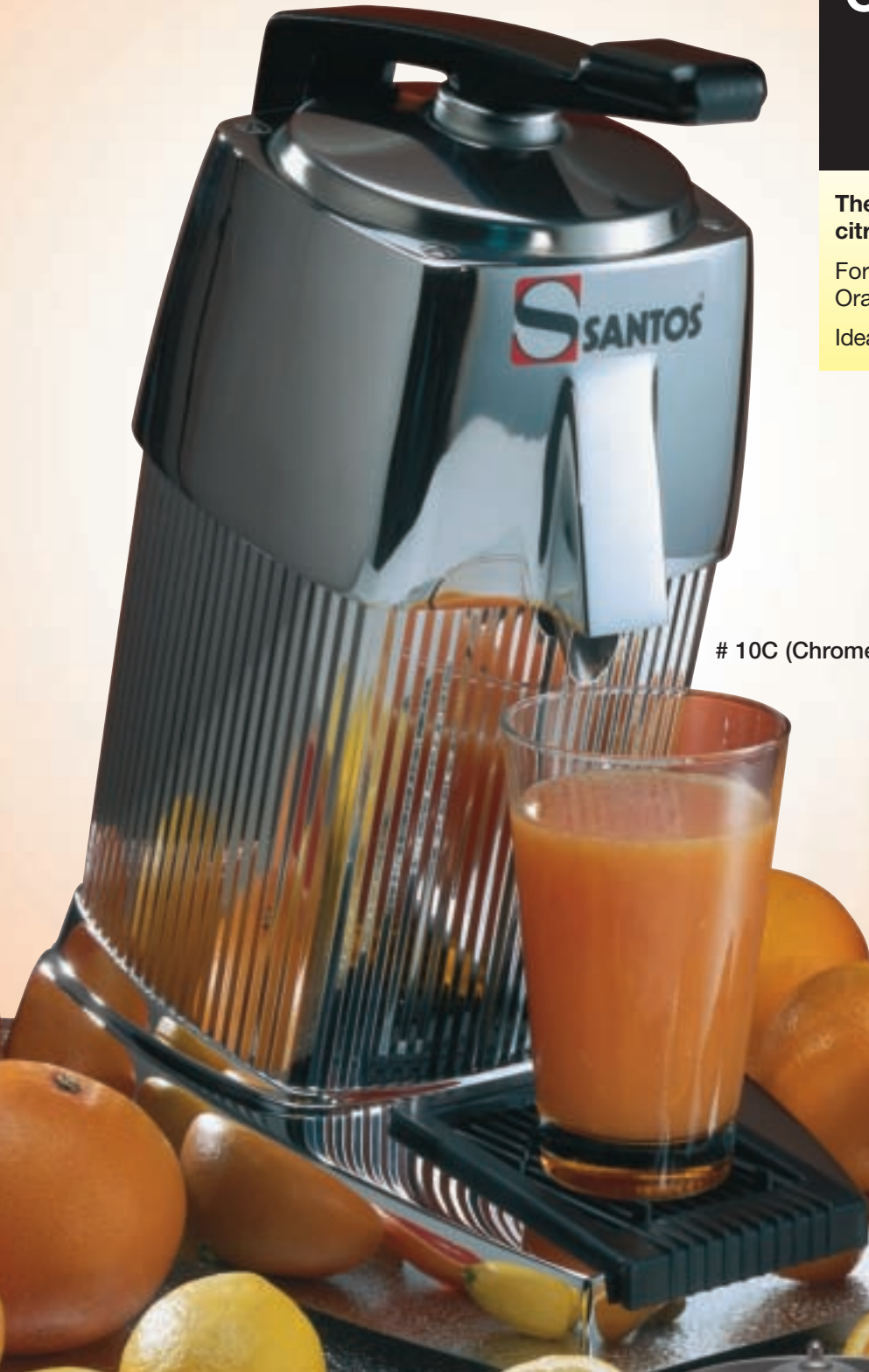
# 10C (Chromed model)